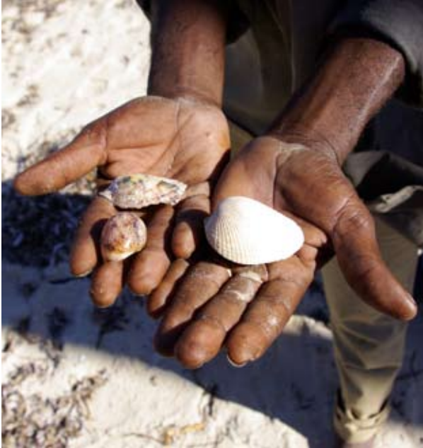
(Mollusk species found dead on Maganja beach on second day of shallow water seismic program).

Possible Red Tide Triggered: Perhaps the most alarming impact on marine organisms during the seismic study was the occurrence of a photoluminescent phytoplankton bloom, perhaps a 'red tide'. Eight of the communities interviewed reported several signs of a 'red tide': light in the water at night (caused by photoluminescent dinoflagellates or phytoplankton), red, brown and murky water, high turbidity, and rashes on people who spent time in the water.