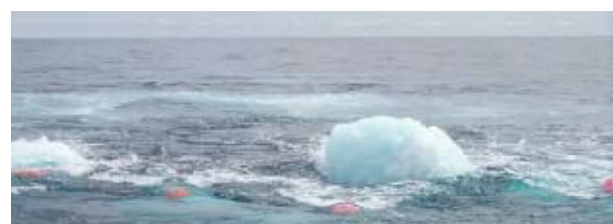
Figure 3: “minimum water depth 5.5 M” (the final seismic line vessel reportS )