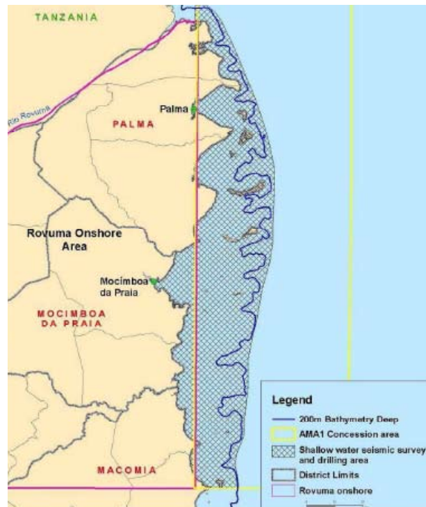
Figure 1: Hatched area represents rough location of the shallow water seismic program

Marine seismic exploration involves firing high decibel air guns under water and recording the sound waves as they bounce off the sea floor and sub-sea-floor geologic strata. This data is then used to determine the geology beneath the sea floor, and the likelihood of hydrocarbons and the formations that trap them. These air guns fire at about 200 decibels ever 7 to 15 seconds, 24 hours a day, for several months at a time. This particular seismic program included about 5,000km of seismic “lines”, meaning the boat traveled for 5,000km in lines back and forth across the shallow water areas of Area 1 in the Rovuma Basin offshore area.